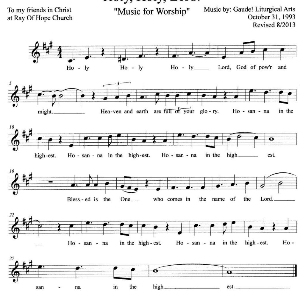
5-4-25 Resurrection Season 3rd Sunday, Year C Page 32 of 45 Holy, Holy, Lord!

©1993 by Gaude! Liturgical Arts. All Rights Reserved. International Copyright Secured. Reprinted here under CCLI#706121