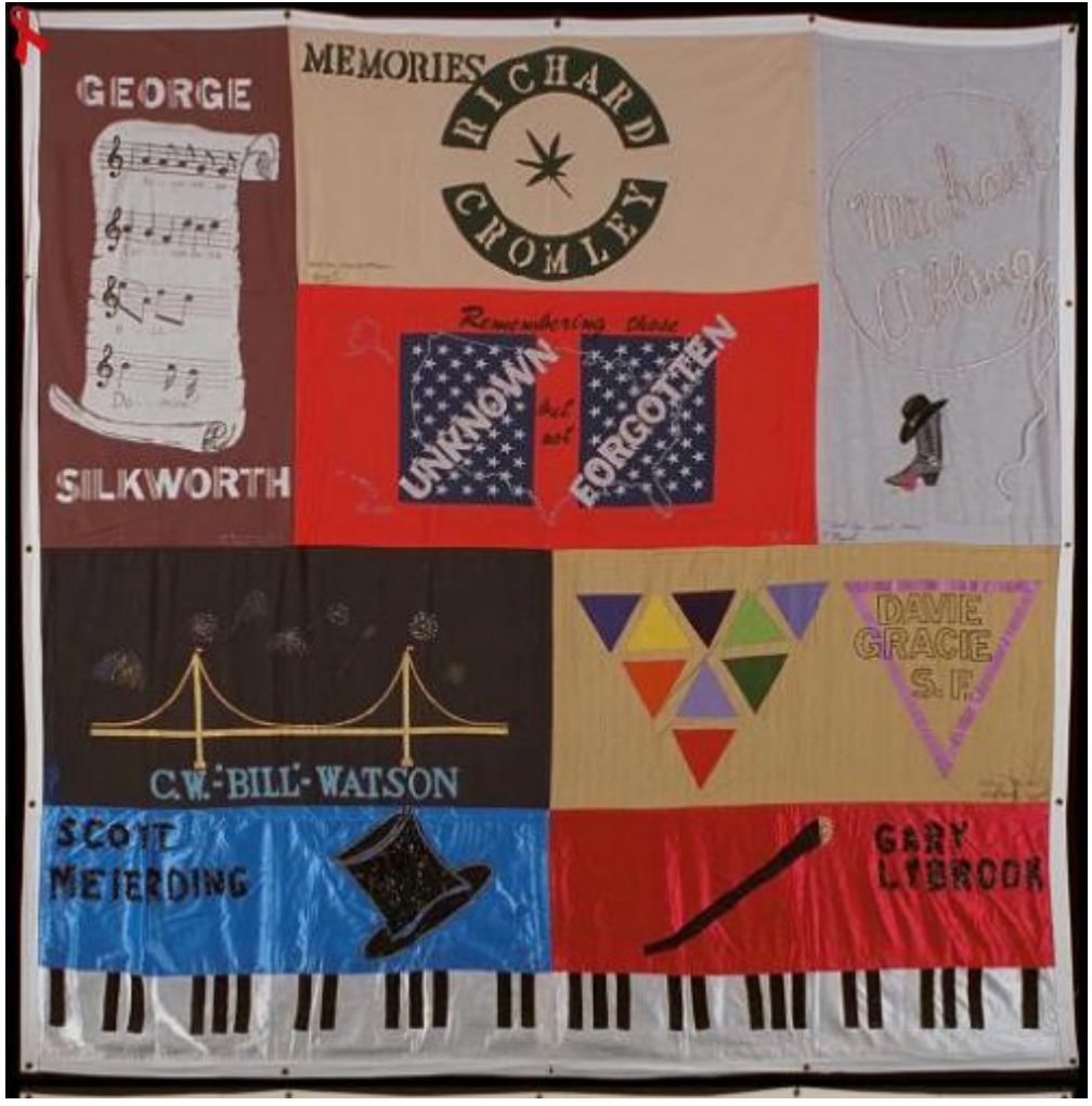
These are the names on Block # 147

Therefore, at Ray Of Hope Church Of Our Lord Jesus Christ, we continue to read aloud over 110,000 names sewn into the AIDS Memorial Quilt to keep HIV/AIDS in the conscious prayers of people. Scroll the page to see the panels on block 147.